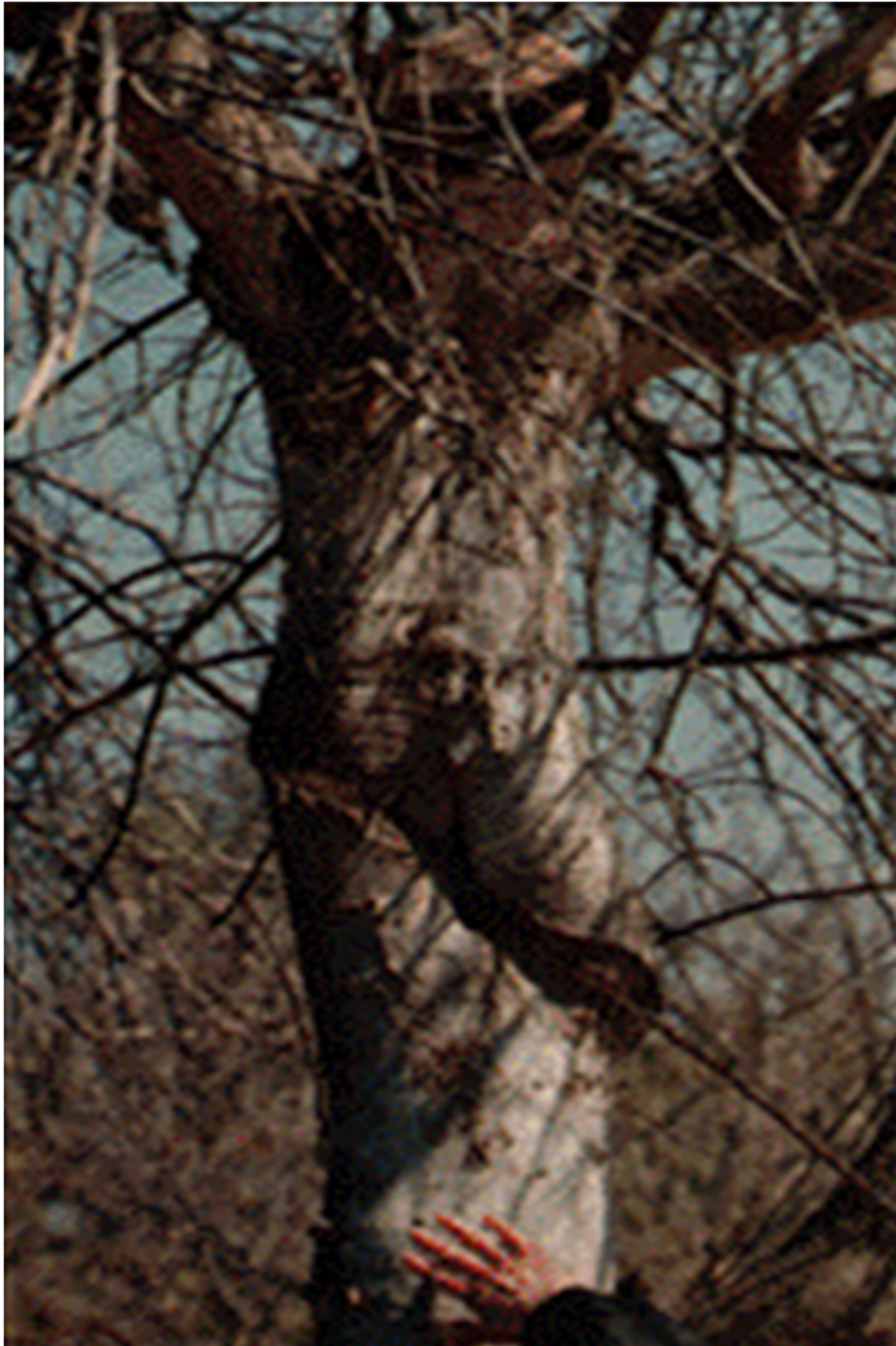
An old newspaper clipping from an unknown source showing a person touching a tree in Crystal City, Texas. The tree resembles Christ on the cross.