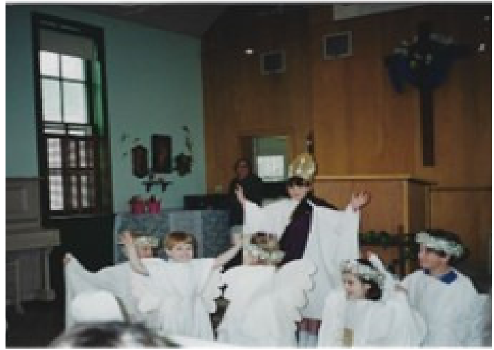
Photos of the Children in their Sunday School Class activities.