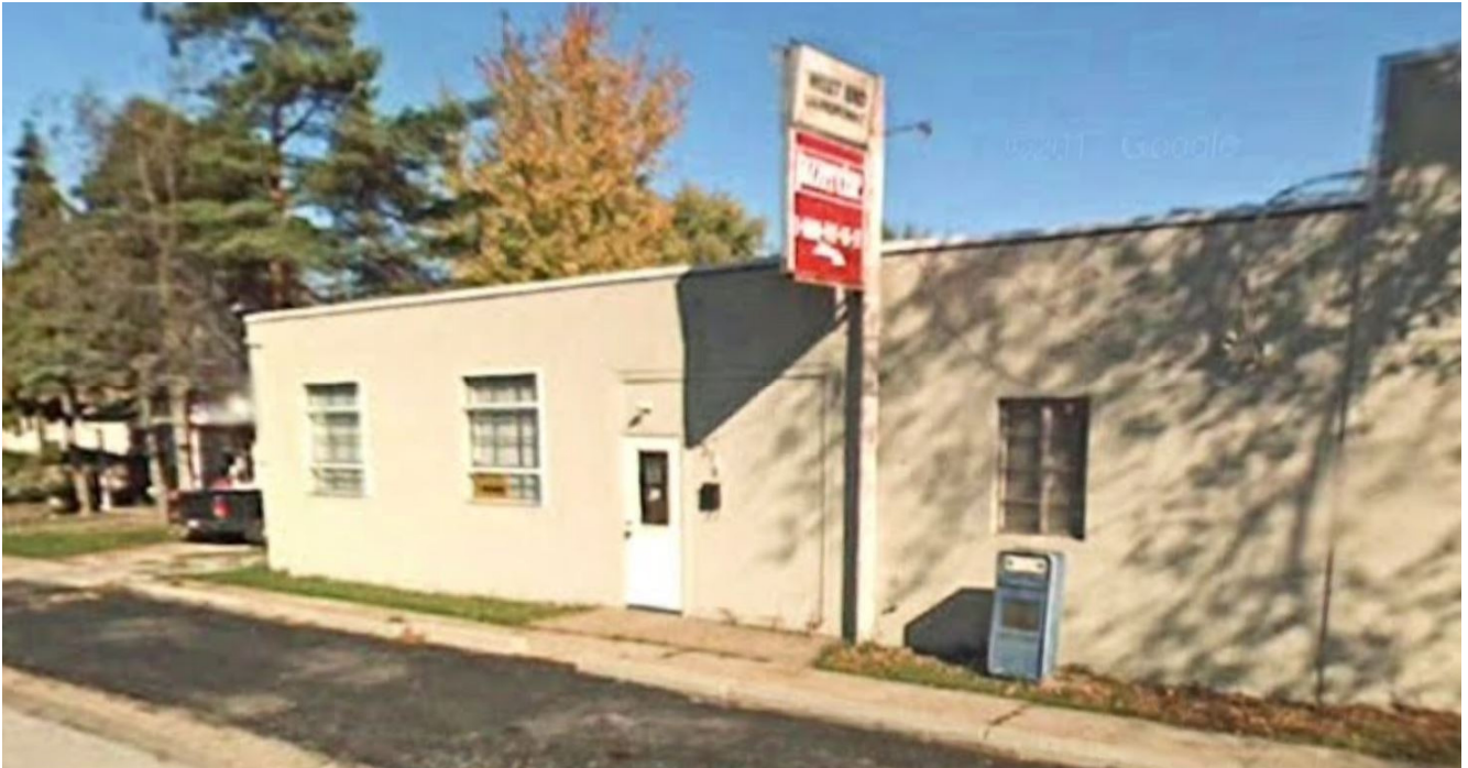
Exterior and interior scenes of the new Mission at Port Clinton, Ohio