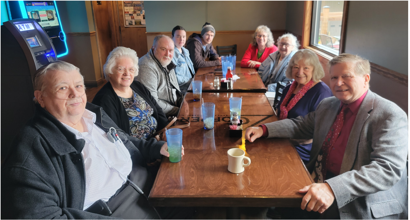
Christmas Dinner at Fairmont, West Virginia, Sunday December 26, 2021