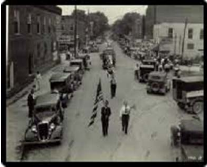
The above scene is of an Assembly parade which was common in A. J. Tomlinson's tenure in office. These parades usually went through downtown Cleveland to the Assembly Tabernacle on Central Avenue.